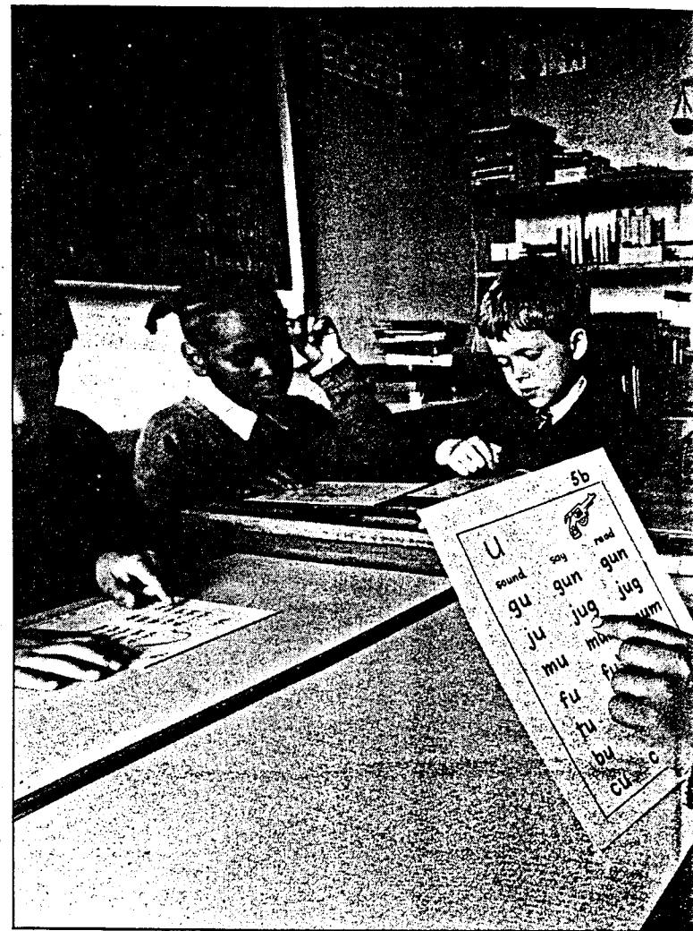
Children learn to read using a different part of the brain than that The evolved architecture of the human mind includes a number of

Knowing that the circuitry of the human mind was designed by the evolutionary process tells us something centrally illuminating: that, aside from those properties acquired by chance or imposed by engineering constraint, the mind consists of a set of information-processing adaptations, designed to solve those adaptive problems that our hunter-gatherer ancestors faced generation after generation. The better we understand